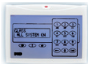
Blue touchscreen display turns Red for alarm conditions.

An attractive new user interface featuring a glass touchscreen instead of traditional keys. Available in White, Black or Platinum, the 7760 adds elegance and style to any installation.