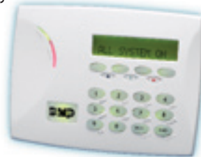
Thinline and Aqualite - Backlit keys and logo turn Red during an alarm.

The stylish and sleek 7000 Series keypads provide three 2-button Panic keys, AC power and Armed LEDs, 32-character display, backlit logo and keyboard plus an internal speaker. Aqualite Series keypads (available Summer 2005) retain all of the same features as the 7000 Series, with the addition of a brilliant blue LCD display and backlighting. Both designs are available in White or Black. Select models are also available in Ivory (Thinline Series) or Platinum (Aqualite Series). Both keypad designs are backward compatible, making the transition to Thinline keypads quick and easy.